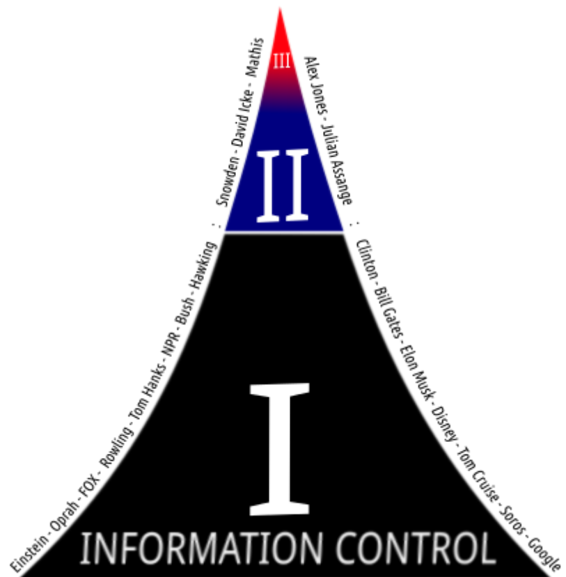
Figure 1) The information control system

Level 1 control pays for itself, or in other words, the majority pay for it